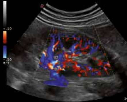
Kidney - Power Doppler