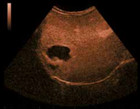
Liver - CnTi