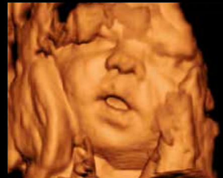
Baby face - X4D